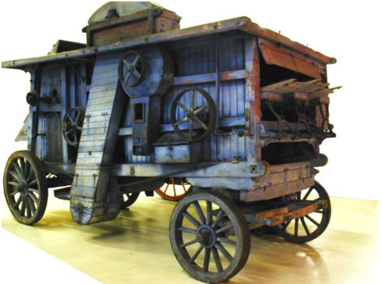
A Threshing Machine at Museum of English Rural Life, University of Reading