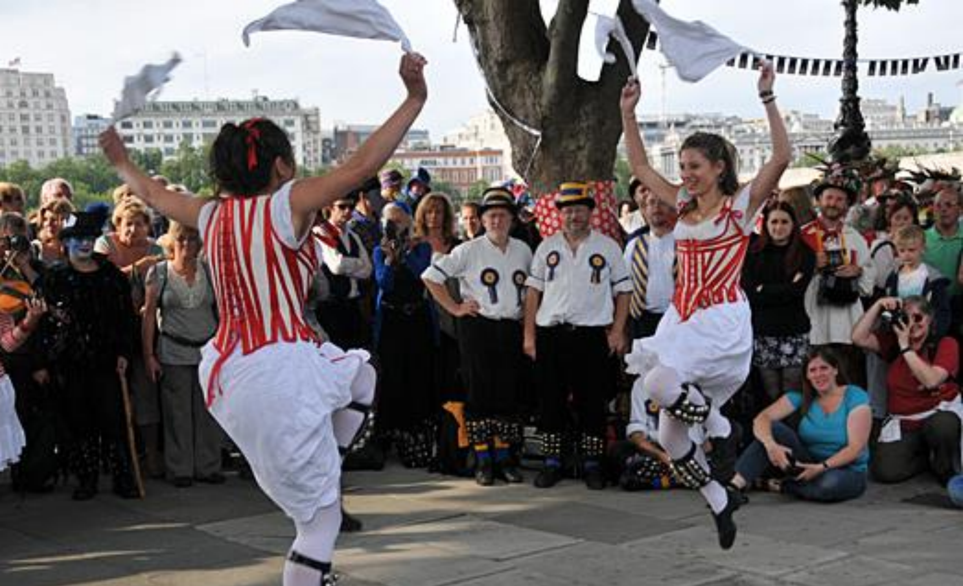
The Belles of London City, Cotswold double jig 5000 Morris Dancers, Southbank, London, 2010