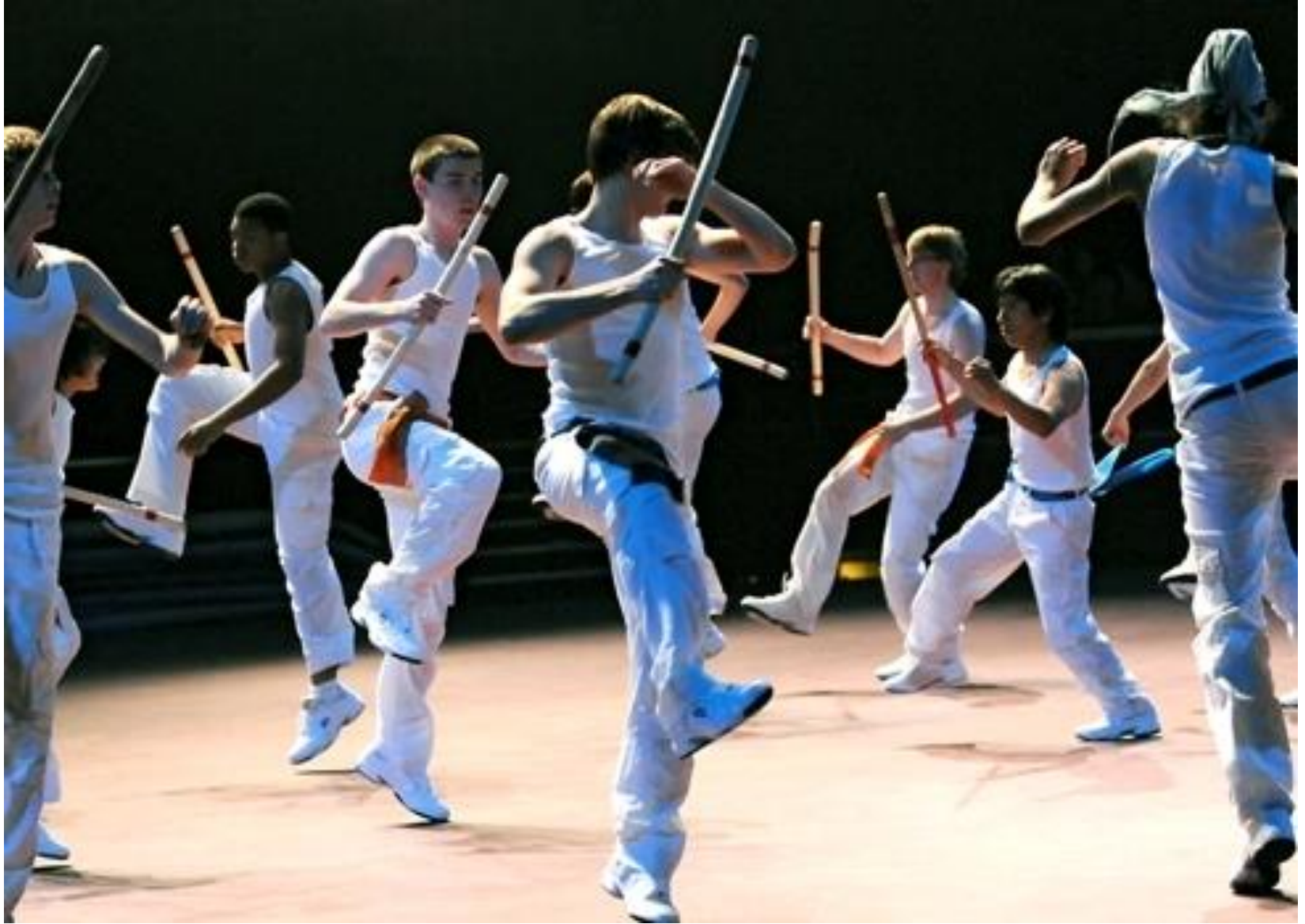
Spring Force contemporary Cotswold morris, dancers So We Boys Dance EFDSS in partnership with Pavilion Dance / Dance South West, Royal Albert Hall, 2010