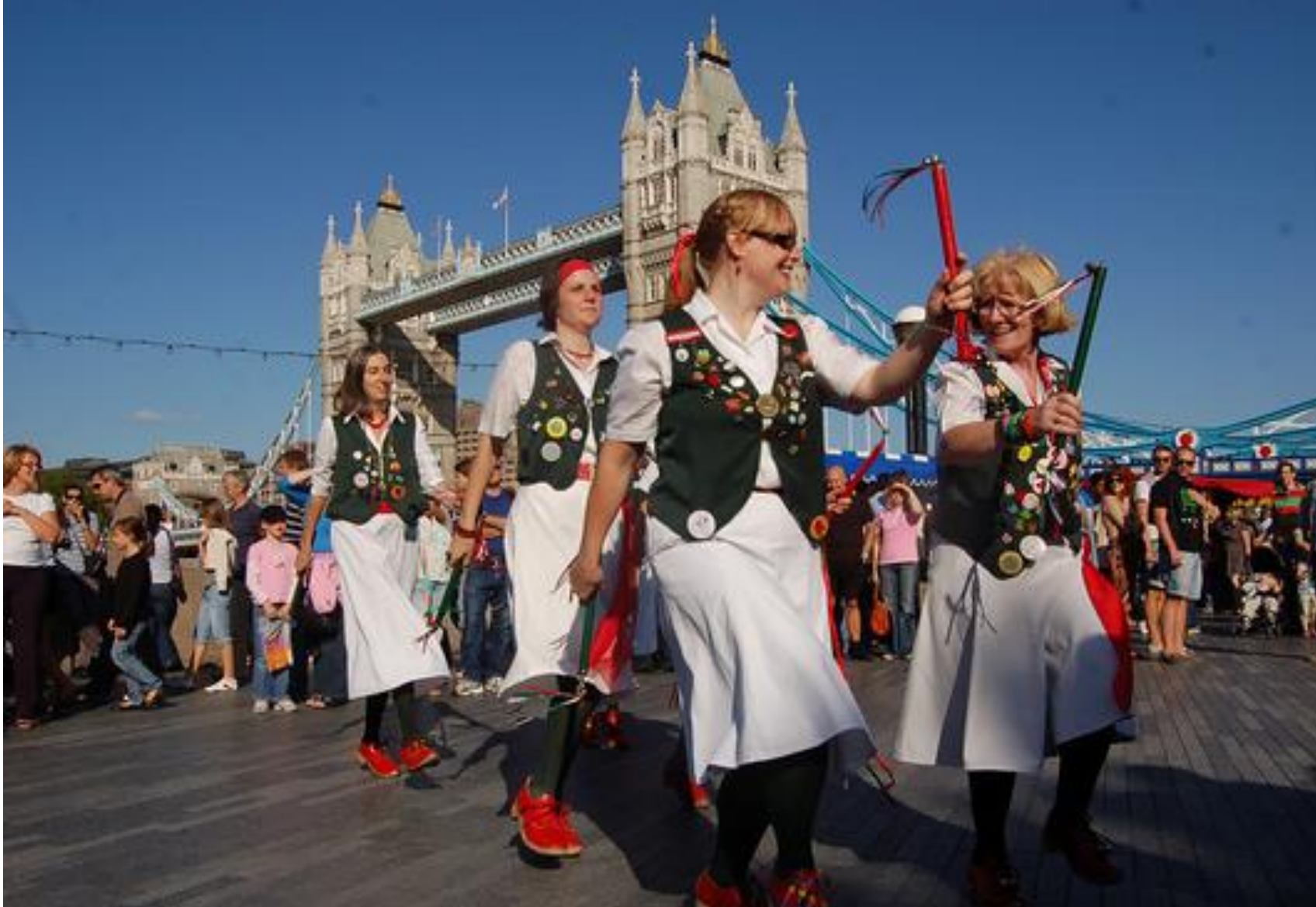
Old Palace Clog, North West morris Tower Bridge, London, 2009