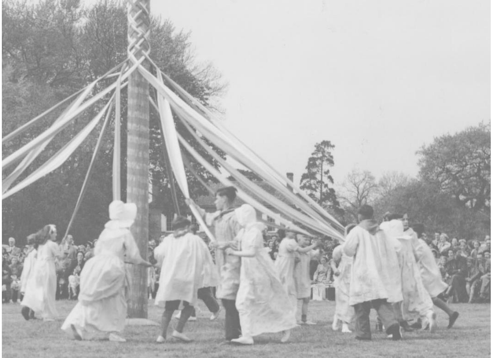
May Day Maypole dancing Ickwell, Bedfordshire, date unknown